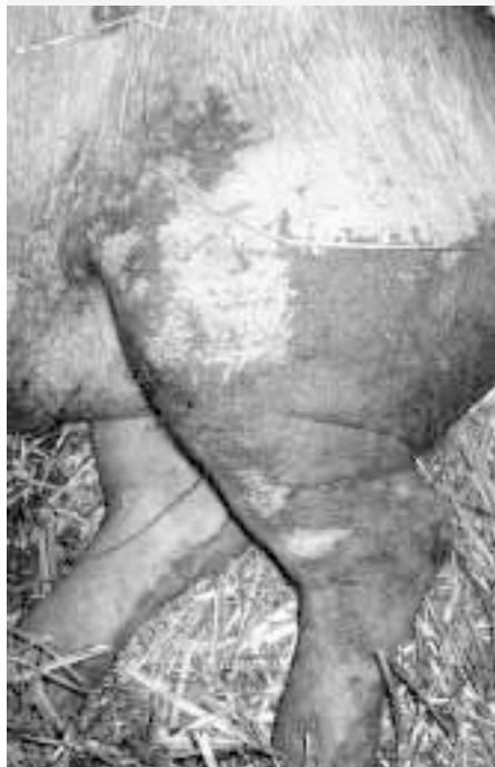
Figure 1: Scalded leg on affected pig